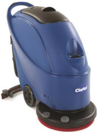
Time savings when using an autoscrubber versus traditional mopping

$ 5,195.00 each Regular price $6195.00 #203547